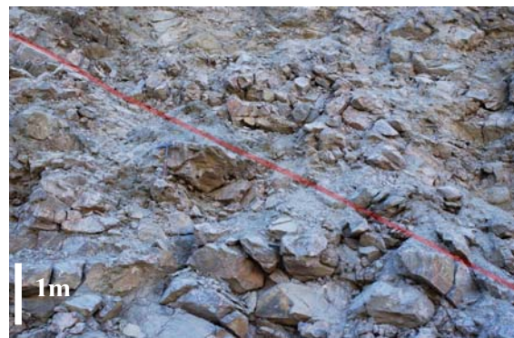
Fig.2: Photograph of K08 CRB. CRB_1 (bottom left) and CRB_2 (top right) are divided by a partially sheared contact (red highlight).

appears coarser, and has either a carbonate matrix or no matrix (void with free growing carbonate crystals). The clasts typically, but not exclusively, have a preferred alignment. The alignment is generally orientated sub-horizontally, but local variations can be more extreme, resembling slump structures. The second facies (CRB_2) visually appears finer-grained, with both angular and sub-angular clasts (i.e. increased rounding), and often includes a sandy matrix infill of local origin. CRB_2 appears more poorly cemented than CRB_1. The preferred clast orientation is stronger in CRB_2, typically dipping towards the centre of the pipe between 0 and 20°. Specific discrete, thin (several centimeters) zones and fracture planes can be identified associated with CRB_2 that dip away from the contacts into the breccia at between 10 and 30° (Fig.2). The structures represent shear planes and shear zones that have geometries indicating a normal shear sense.